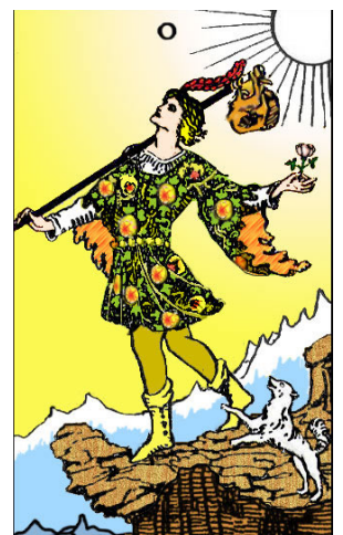
The Portrait of the Wyse-ard